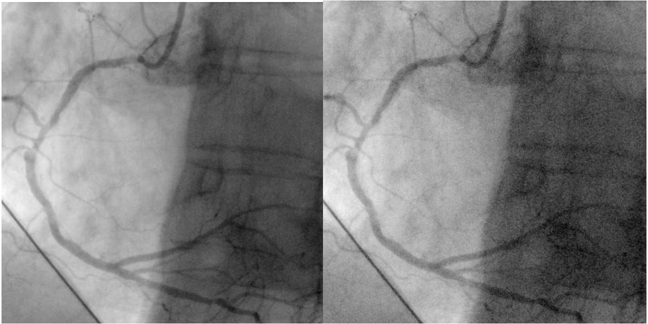
Figure 1. Single image frame from original angiogram (left) and with noise added to simulate 60% dose reduction (right).